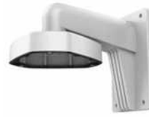
DS-1273ZJ-DM25 Wall Mount