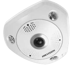
Without -V Model