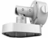
DS-1283ZJ Wall Mount (3-axis Adjustment)