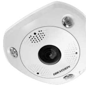
With -V Model