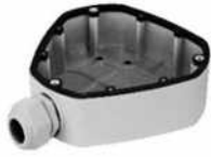
DS-1280ZJ-DM25 Junction Box