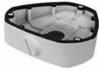
DS-1281ZJ-DM25 Inclined Ceiling Mount