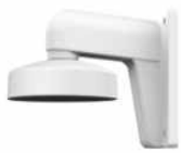
DS-1272ZJ-110-TRS Wall Mount