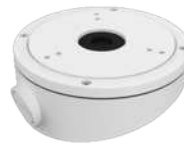
DS-1281ZJ-S Inclined Base Mount