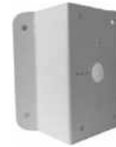
DS-1276ZJ Corner Mount